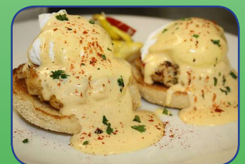
Crab Cake Benedict

Mixed gourmet greens, grilled chicken, fresh strawberries, walnuts, tomatoes with Blueberry Balsamic Vinaigrette.