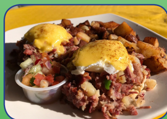
OMG Homemade Corned Beef Hash

Challah bread french toast stuffed with fresh bananas & blueberries sauteed in a sauce of butter, brown sugar, cinnamon & dark rum.